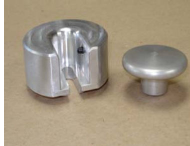
Figure # 1