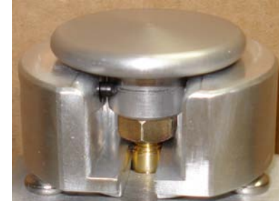
Figure # 3