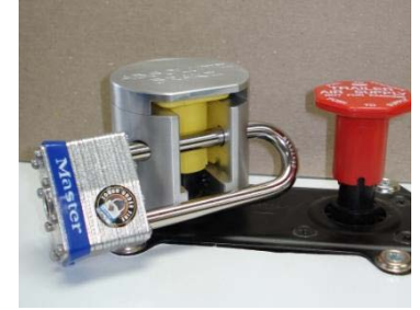
Figure # 4