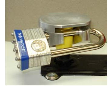
Figure # 4

INSTALLATION INSTRUCTIONS FOR COMMERCIAL BENDIX CONTROLLER VALVE