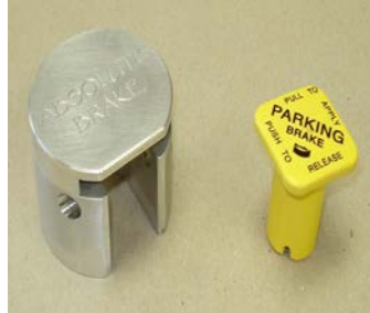
Figure # 1