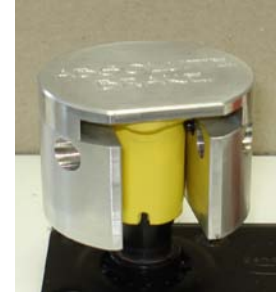
Figure # 3