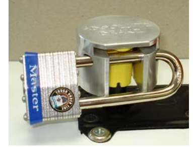
Figure # 4

INSTALLATION INSTRUCTIONS FOR COMMERCIAL BENDIX CONTROLLER VALVE