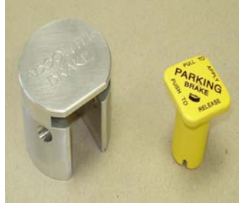
Figure # 1